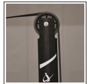
4" DIAMETER POLYCARBONATE PULLEY WHEEL